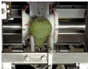
The newly designed roll orienter

When taken in conjunction with each other, the improved orientation and the improvement in peeling yield combine to give a 10% improvement in throughput yield. This means that for the same output the processor is able to utilize 10% less raw product as compared to the standard Atlas Pacific Pear peeler. In other words, for each ton of raw product processed the new machine produces 280 pounds (127 kg) of added useable finished product.