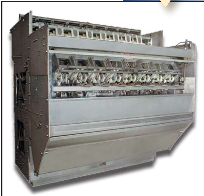
Stainless steel HS8 Automatic Pear Peeler (guards removed)

Atlas Pacific is proud to introduce the new HS8 (High Speed/8 Lane) Pear Peeler designed to maximize pear production. The new 8-lane machine features non-corrosive construction and superior feeding, orienting, and peeling capabilities which lead directly to processor savings.